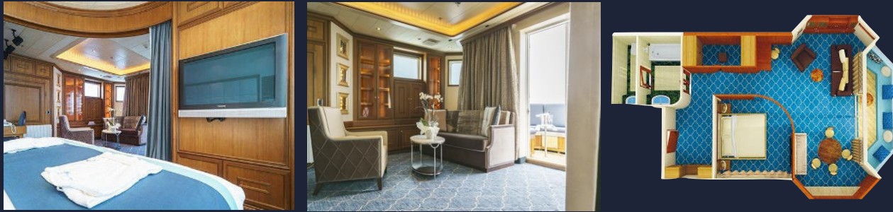
Owner's Suite 63 Sq/M Private Deck