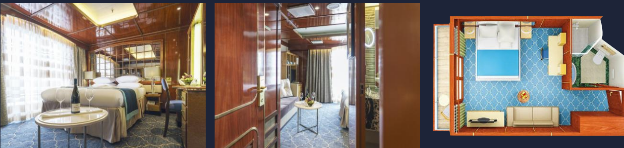
Deluxe Suite 24 Sq/M Private Balcony