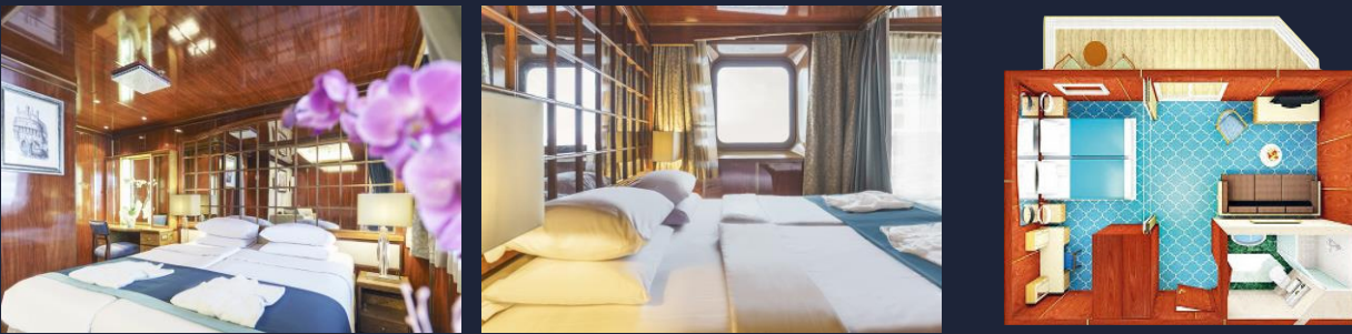
Premium Suite 30 Sq/M Sq/M Private Balcony