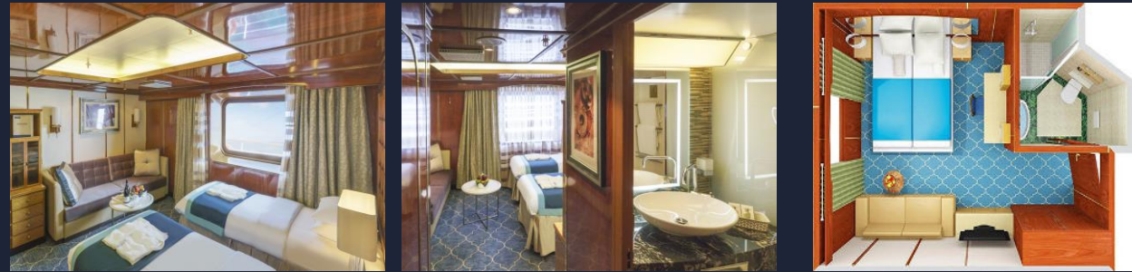
Superior Suite 20 Sq/M Picture Window