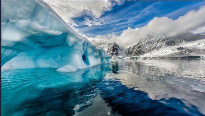
THE CAPTAINS BRIDGE