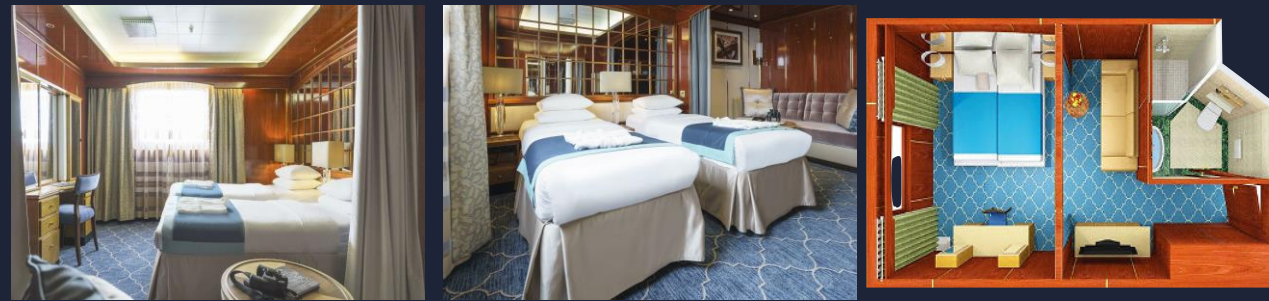
Classic Suite 21 Sq/M Picture Window